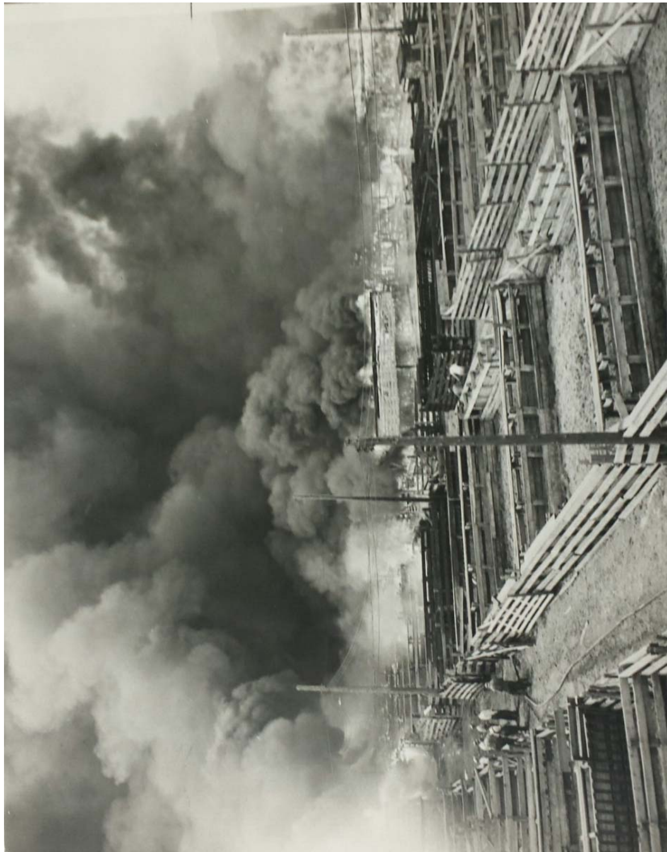
In May, 1948 a fire broke out in the cattle pens in the Stockyards resulting in an estimated $644,000.00 loss.