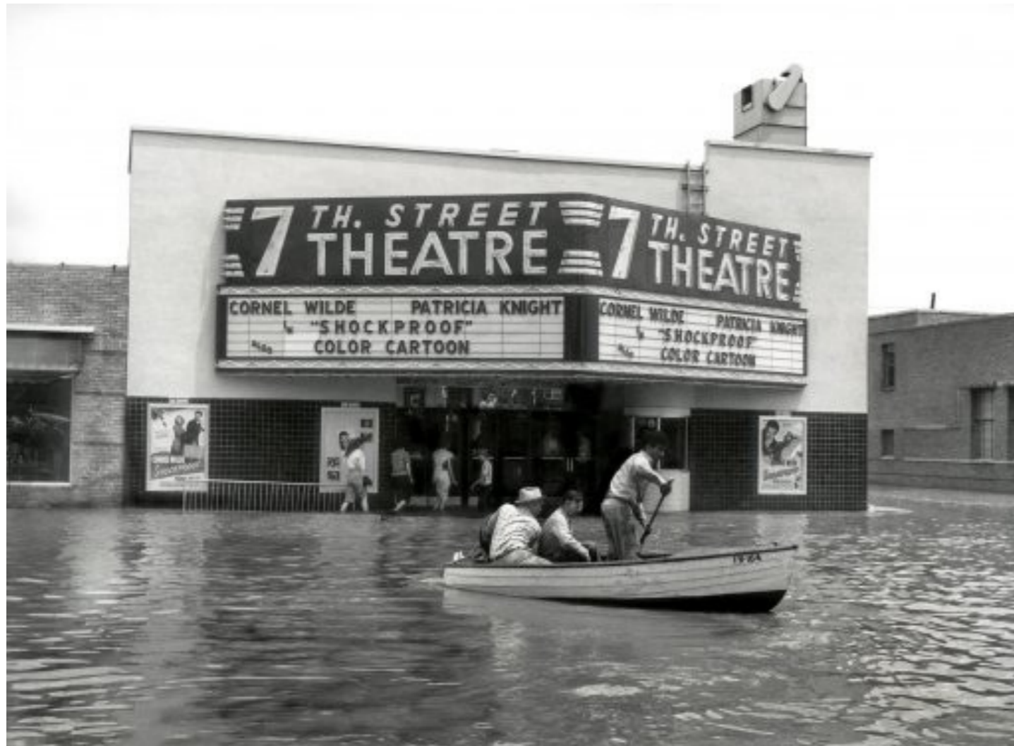
People in a boat on 7th Street during the flood in 1949.

A headline from the May 18, 1949 Fort Worth Star-Telegram