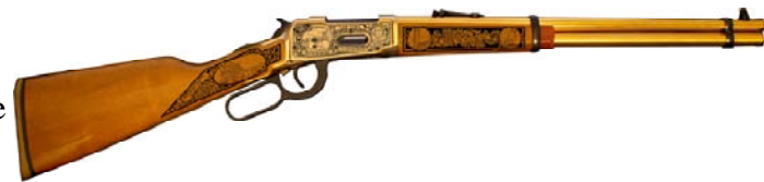
The "Fort Worth Heritage" Rifle