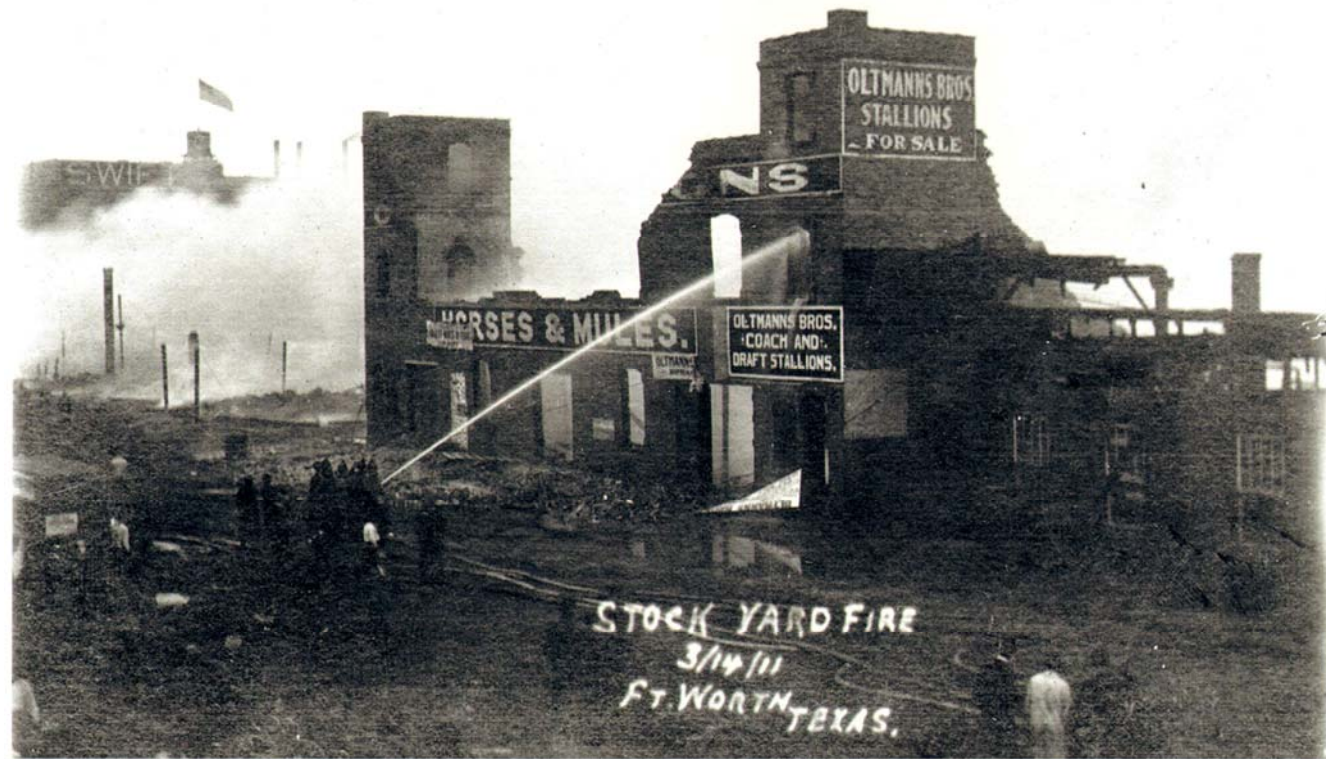
On March 14, 1911 a devastating fire swept through the Stockyards, destroying Mule Alley and killing the livestock there. The yards were rebuilt with an eye toward using as much non-flammable material as possible.