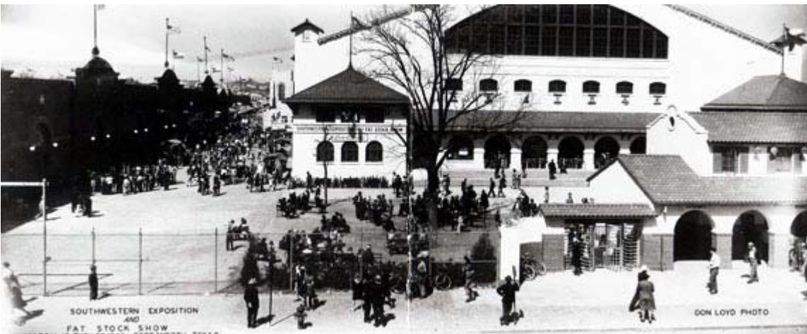
Don Loyd Photo of the last Southwestern Exposition and Fat Stock Show held at the North Fort Worth Coliseum and Exhibition facilities. The next year, 1943, the exhibition halls were used to assemble aircraft. In 1944 the SE&FSS moved to its present location at Will Rogers Coliseum.